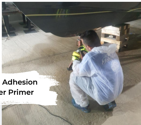
Applying Adhesion Promoter Primer