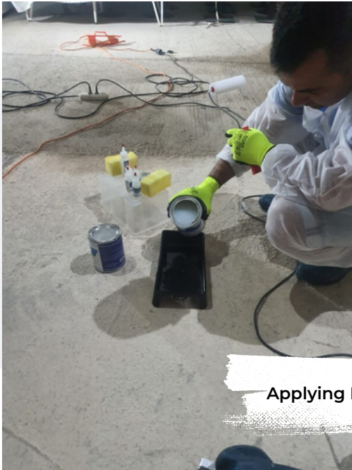
Applying Hull Maxx™