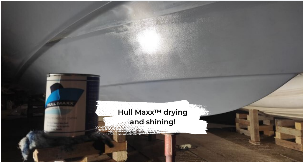
Hull Maxx™ drying and shining!